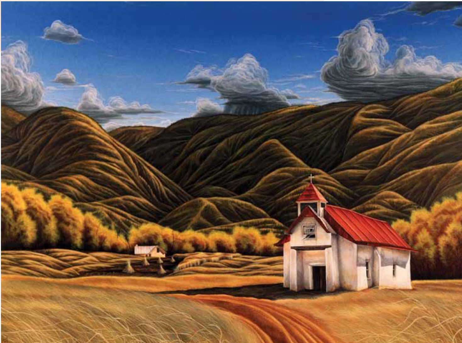
Edge of Town, dry-brush watercolor, 22 x 30.